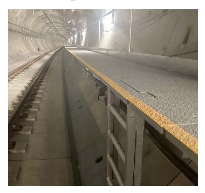
Forrestfield Tunnel Perth 14 kms Rail Detraining Walkway supplied

Gripspan – roll formed plank design enables greater unsupported spans compared to traditional industrial flooring