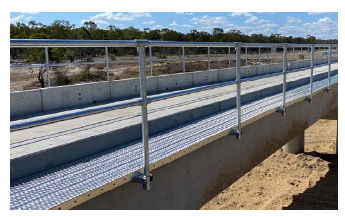
Carmichael Rail Regional QLD