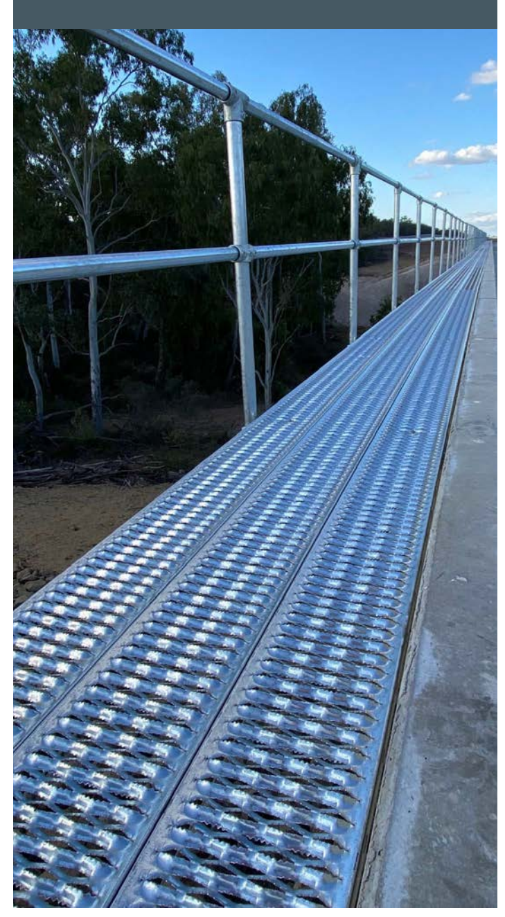
Charmichael Rail Regional QLD 4.2 kms Rail Maintenance Walkway supplied

Gripspan – roll formed plank design enables greater unsupported spans compared to traditional industrial flooring