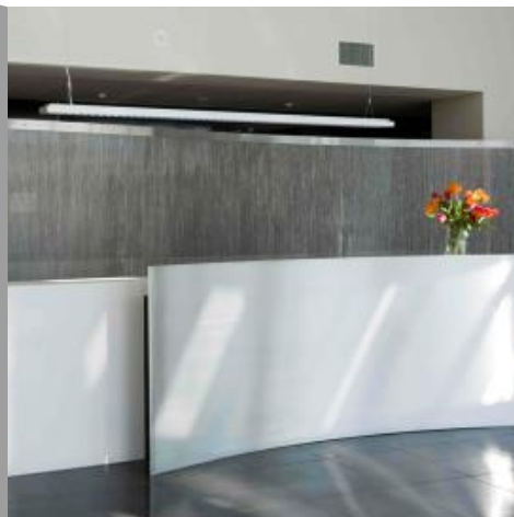
* Typical Architectural Installation