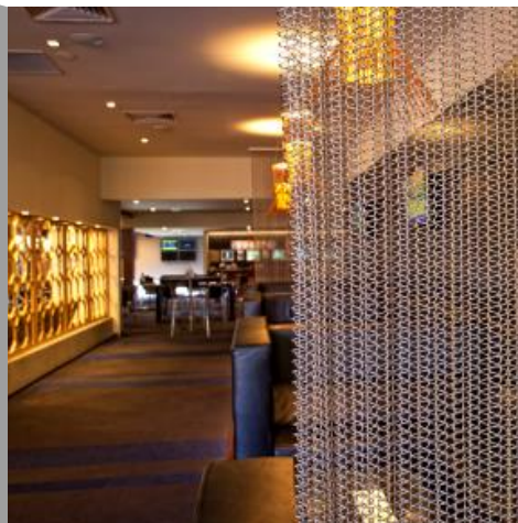
* Typical Architectural Installation