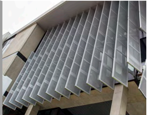
*Typical Architectural Installation