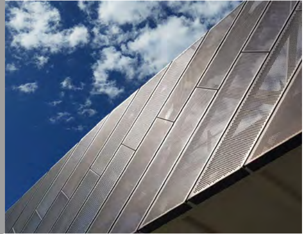
*Typical Architectural Installation