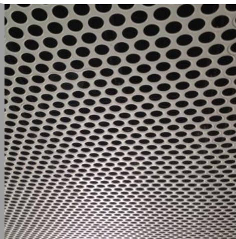
*Typical Architectural Installation