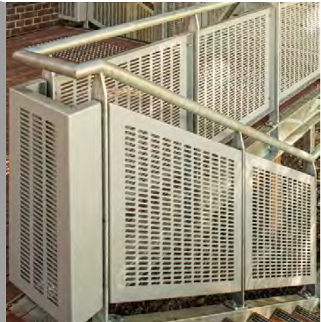
*Typical Architectural Installation