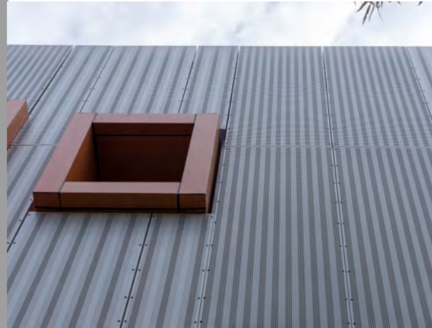
*Typical Architectural Installation