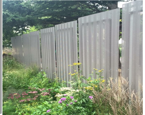
*Typical Architectural Installation