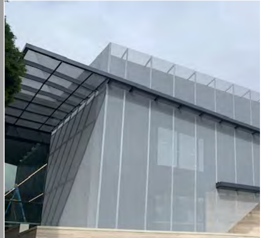
* Typical Architectural installation