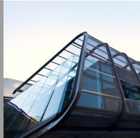
Hotel Ibis Façade, Sydney