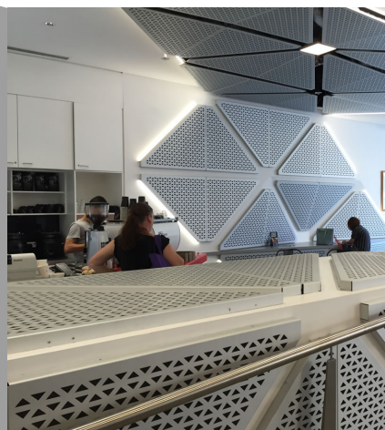
* Typical Architectural Installation of Perforated metal with varying hole sizes