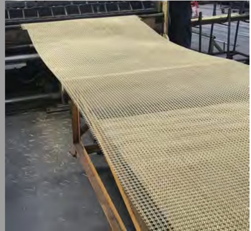
* Manufacturing Illustration