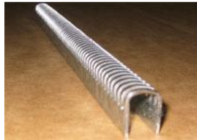
Square Metal: To suit flat bar supports without capping rubber.