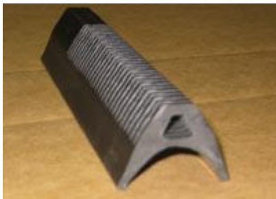
Round Plastic: To suit round support bars or cupping rubber.