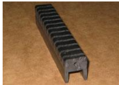
Square Plastic: To suit flat bar supports without capping rubber.