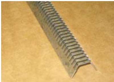
Round Metal: To suit round support bars or capping rubber

The correct spacer type for the screen box and specification is all important. Harp screens are available with four different spacer types.